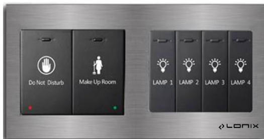
Burshed Steel Dual Frame with LX-S4-2BTN-LED and LX-S4-4BTN