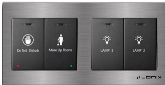
Burshed Steel Dual Frame with LX-S4-2BTN-LED and LX-S4-2BTN